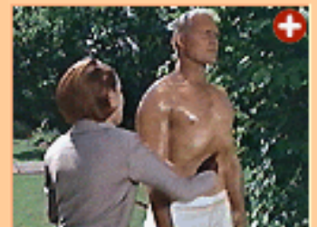
Roll with the punches

The secret agent-as-soldier was the perfect metaphor for the Cold War, a theater of battle without uniforms or group maneuvers. In this new war, solitary men in suits died quietly in closed train compartments, in crowds with the whisper of a silencer, or by poison injected with the point of an umbrella. And in contrast to the traditional field of war, the Cold War enemy was never easy to spot. Sometimes he or she was the least suspected among us, sometimes the most beautiful, sometimes the most trusted. As the post-World War II era of film shook out, espionage and paranoia would prove two of its most enduring themes.